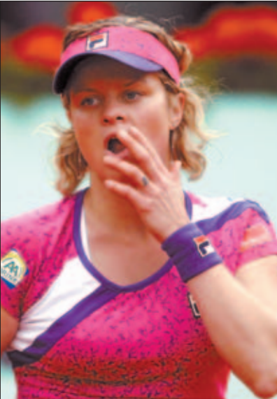
No. 2 seed Kim Clijsters fell 3-6, 7-5, 6-1 to Arantxa Rus of the Netherlands in the second round of French Open action on Thursday.

PARIS — There were plenty of excuses available for Kim Clijsters after a stunning collapse in the second round of the French Open against a woman ranked 114th. In assessing her 3-6, 7-5, 6-1 loss to Arantxa Rus of the Netherlands on Thursday, the second-seeded Clijsters could have pointed to her heavily taped right ankle, which she hurt while dancing barefoot at her cousin's wedding last month. In recounting how she managed to waste two match points and drop 11 of the last 12 games after leading 5-2 in the second set, the Belgian could have mentioned that she last entered the French Open in 2006, and had played a total of five clay-court matches anywhere since. And in explaining her 65 unforced errors — 43 more than her opponent made — and 10 double-faults, Clijsters could have reminded everyone that she hadn't competed at all since late March because of that bum ankle and previous injuries to her right shoulder and wrist. Instead, the winner of the last two Grand Slam titles, and four overall, pointed a finger squarely at herself and